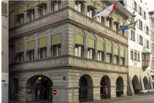
Zunfthaus zur Saffran Limmatquai 54 Zurich

The opening lecture and dinner on Friday, October 3 will be held at the Zunfthaus zur Saffran, the home not only of the oldest Guild in Zurich but also the first to have its own location. The original Guild built its own house in 1417. The present three-storey Guild House building at Limatquai 54 was built between 1719 and 1723 in the Regency style, an early form of Rococo, and stands in a row of five medieval buildings facing Zurich's City Council Hall. It is a special privilege to celebrate the Zurich Lecture Series at this historic location.