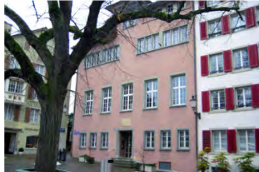
Lavatersaal at St. Peter's Church St. Peter-Hofstatt 6 Zurich

Friday, October 3 , 6:00 pm: Reception; 6:30pm: Lecture; 7:30-9:00pm: Three-Course Dinner. Location: the historic Zunfthaus zur Saffran, Limmatquai 54, Zürich.